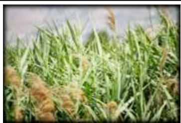
Jesus's parable about the wheat and the weeds helps us to understand why evil is growing

In Matthew 13 there is a parable that Jesus told about a farmer who sowed good seed in his field. Then an enemy sowed weed seeds. His servants suggested rooting out the weeds at once. But the farmer advised leaving well alone until the harvest, lest the wheat be damaged. When the harvest came, the weeds were gathered and burned and the good grain saved. This parable helps us to understand why evil exists and why we should expect evil and good to go on growing together.