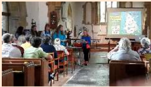
The Guides explain their trip

On Sunday 11th June we welcomed the local Guides to our united all-age service. During the service they told us about their planned trip to Sri Lanka in 2018. The morning's collection was donated to help the costs of their trip.