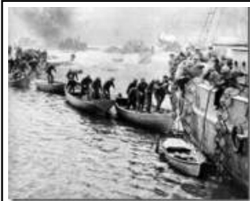
Troops being rescued at Dunkirk

Three factors were important in the success of the evacuation, which many regard as miraculous. Hitler ordered the German army to halt its advance — much to the frustration of his generals, a storm grounded the Luftwaffe, and the subsequent calm sea enabled the flotilla of boats to reach the beach. The stranded troops were saved, to fight another day. After the war Winston Churchill acknowledged the miracle. He said, “I shall never understand why the German Army did not finish the British Army at Dunkirk.”